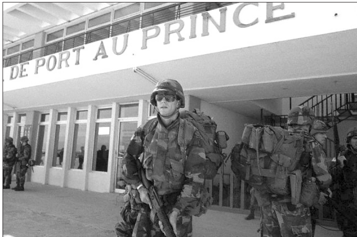
UN troops arrive in Haiti 2004

In late February of 2004 Haitian President Jean Bertrand Aristide was the subject of a coup de etat. Aristide states that he was forced onto a plane by US soldiers and flown to Central Africa. After the Ousting of the democratically elected leader, foreign troops have moved in, under the UN banner, and set up the UN occupation. The official aims of the UN in Haiti are to train a police force, and reinstall the disbanded military. Imperialist nations such as Canada and the US have made it clear that the occupation of Haiti will continue until a structure has taken hold of Haiti that benefits imperialism. The agenda of the UN in Haiti is to implement structure that will not support the people of Haiti. Self-determination is a condition that the UN cannot address, as it contradicts the existence of UN forces in Haiti.