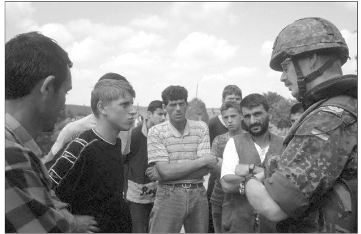
Serbs Argue with a German UN Soldier

force in the territory. The US designed accord split the former Yugoslav Republic into Bosnia-Herzegovina along racial lines for the benefit of imperialists. After the NATO led bombing campaign