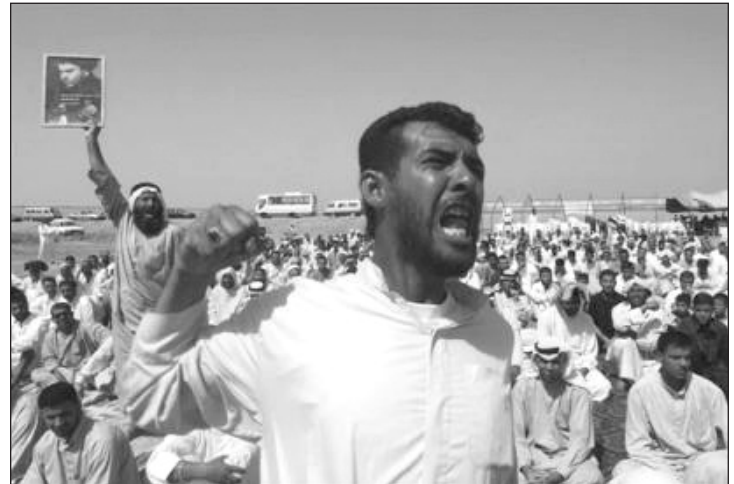
Iraqi man shouting anti US slogans at protest

The origin of this lack of confidence is certainly in the decade of sanctions that the UN punished the Iraqi people with, but this feeling that the UN is not on the side of the people of Iraq has only been confirmed as absolutely true by the UN's support of the occupation up to now.