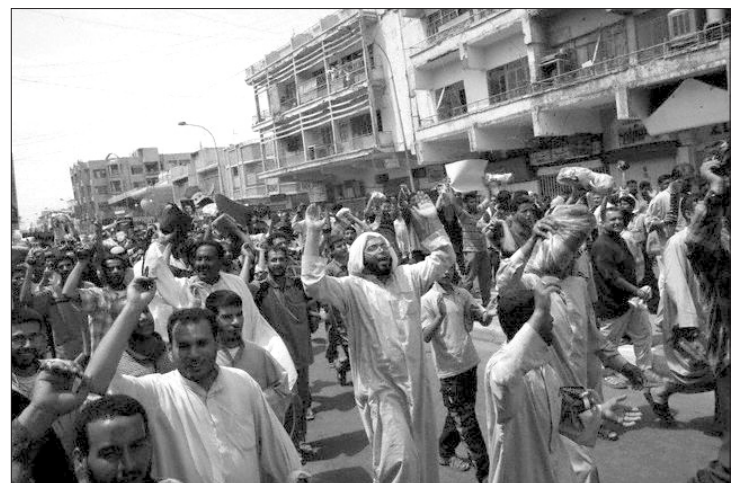
Demonstration in Falluja April, 2004

However, John Kerry's promise that he would be better than George Bush at winning "our allies to our side" means that the US ruling class is keeping this option open, and is preparing to give major concessions to their rivals if it is absolutely necessary to not completely lose Iraq.