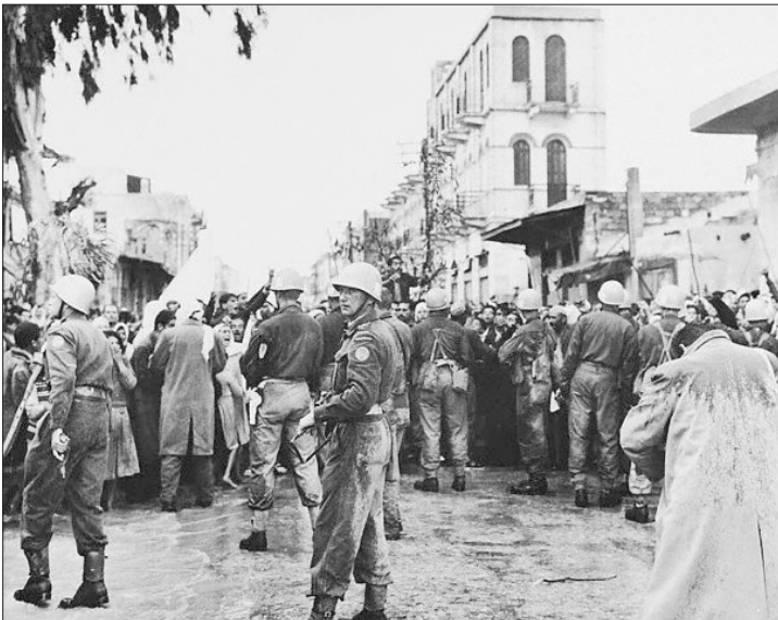
UN Soldiers break up demonstration in Palestine 1956

In 1974 following the Arab Summit in Rabat, the UN granted the Palestinian Liberation Organization (PLO) "observer status" within the UN. The reason behind the UN granting this was to add a sense of democratic discussion to their intervention in Palestine, without actually involving the PLO in the decision making process of the UN.