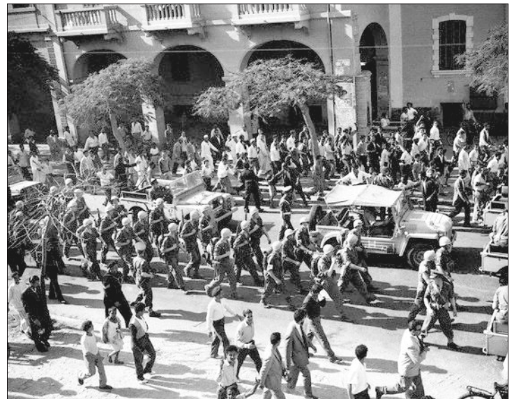
Israeli Troops invade the Suez Canal

In 1956 Egyptian president Gamal Abdel-Nasser reacted to the broken promises of the US and British to finance the Aswan Dam by nationalizing the Suez Canal. Britain and France afraid of losing access to oil shipments from the Middle East, as well as foreign investments, allied with Israel to organize a military action to invade the canal and kill president Nasser. In October of 1956 Israeli soldiers invaded Egypt. Britain and France severing their allegiance demanded the immediate withdraw of Israeli and Egyptian forces from the canal. The U.S. had reacted by using the UN to withdraw troops and keep the Middle East open for further U.S. imperialist domination. By December of 1956 the UN issued a cease-fire, British and French troops withdrew from Egypt, soon to be followed by the Israeli forces.