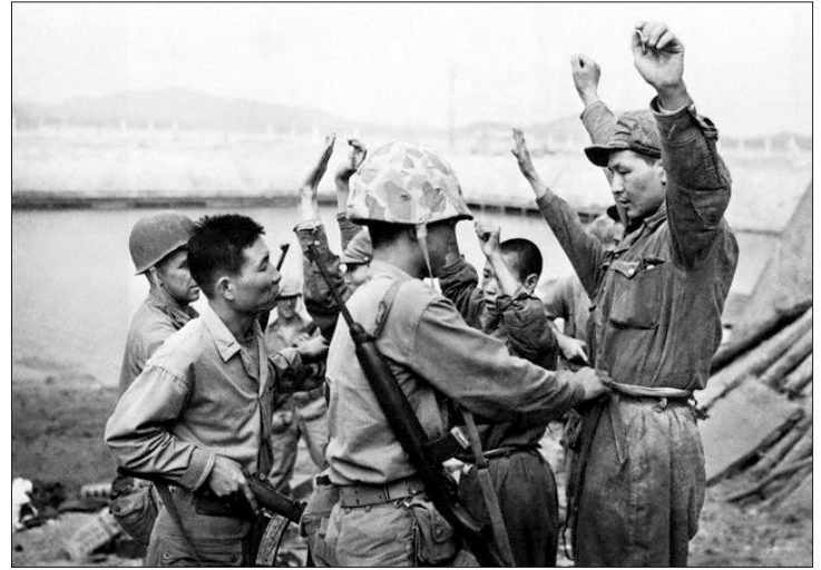
UN Soldiers arresting North Korean troops, 1952

Interest from rival imperialist countries in supporting the occupation of Iraq has not only picked up because they are now in a better bargaining position than they were a year ago. The bigger factor for their interest lies in the threat that is posed to them by the Iraqi resistance. Through their heroic fight against US imperialism, the Iraqi resistance has emboldened the anti-imperialist movement around the world. The shockwaves that would result from the expulsion of the US-UK forces from Iraq would seriously destabilize