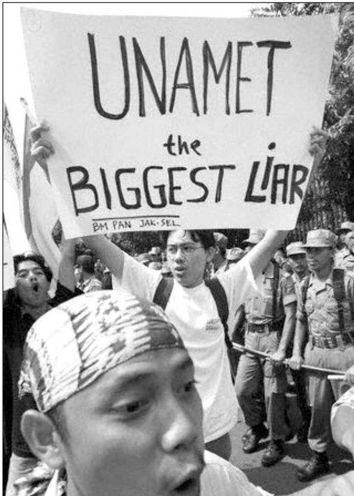
Demonstration against UN mission in East Timor

Following a long history of Imperialist intervention, East Timor a former victim of Portuguese colonialism was invaded and annexed by Indonesia. As a result of the invasion, and the oppressive conditions that were created, 200,000 East Timorese were killed.