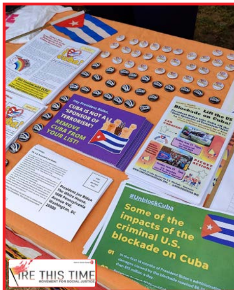
Solidarity Tabling by Vancouver Communities in Solidarity with Cuba

We have been working on webinars, forums, film showings, conferences, info tabling, poetry and art events, protests, caravans, pickets, and many other actions to bring in new people to