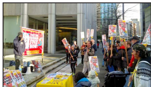
Free the Cuban 5 Committee-Vancouver monthly picket actions in front of the United States Consulate

hundreds of people in Halifax, Montréal, Québec, Kingston, Ottawa, Toronto, Hamilton, Kitchener-Waterloo, Niagara, Winnipeg, Vancouver, and Victoria. [...]