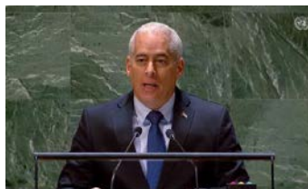
Ambassador Gerardo Peñalver Portal, first vice minister of Foreign Affairs and Permanent Representative of Cuba to the United Nations

Regarding the situation in Gaza, Peñalver Portal warned that the United Nations cannot remain silent in the face of collective punishment,