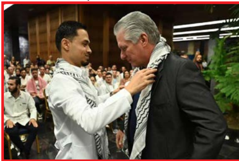
Above: Cuban President Miguel Díaz Canel receives keffiyeh from a Palestinian student studying medicine in Cuba.