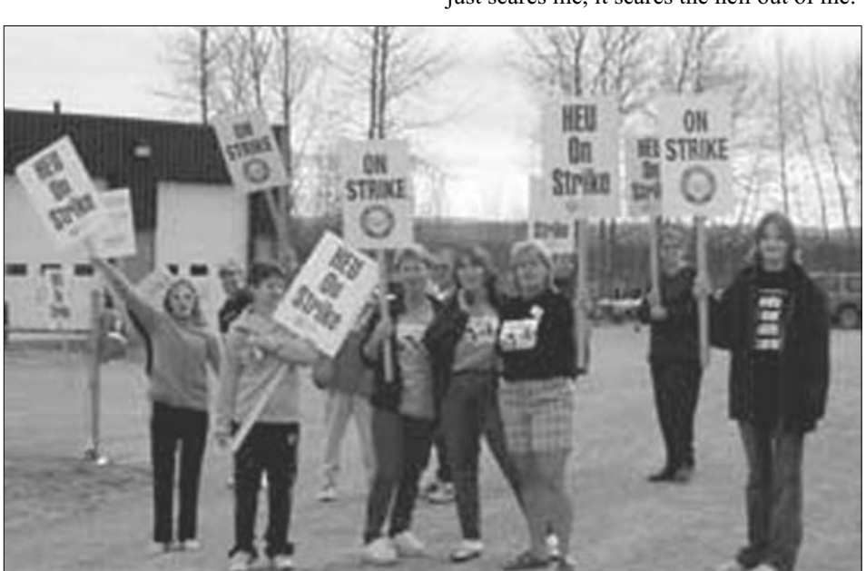
HEU workers on Strike in Nelson BC, April 28th 2004.

These HEU members, whose voices are recorded below, were among the many who welcomed us, thanked us for our support and asked us to come back with more and more people to join the fight for health care and workers rights everyday until the strike is won