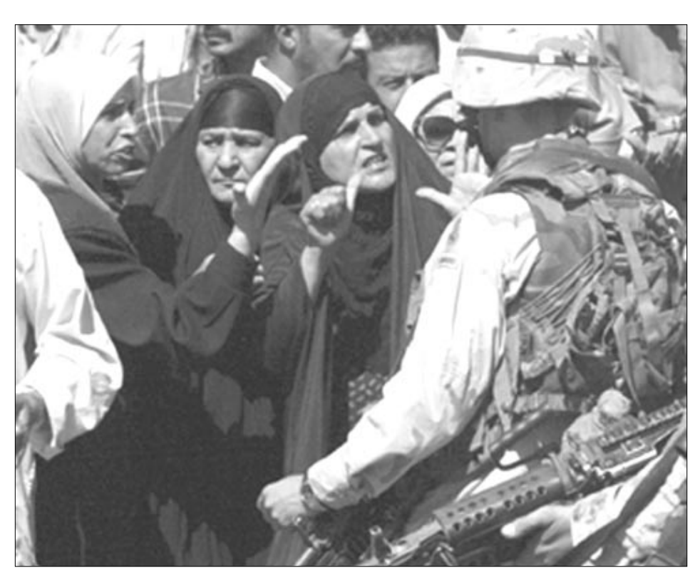
Women workers protest in demand of backpay in Baghdad, April 2004.

In reality, stability is a distant goal for the occupation forces. The process of privatization in Iraq is being met with fervent opposition across the country. Those who have jobs in Iraq predict that