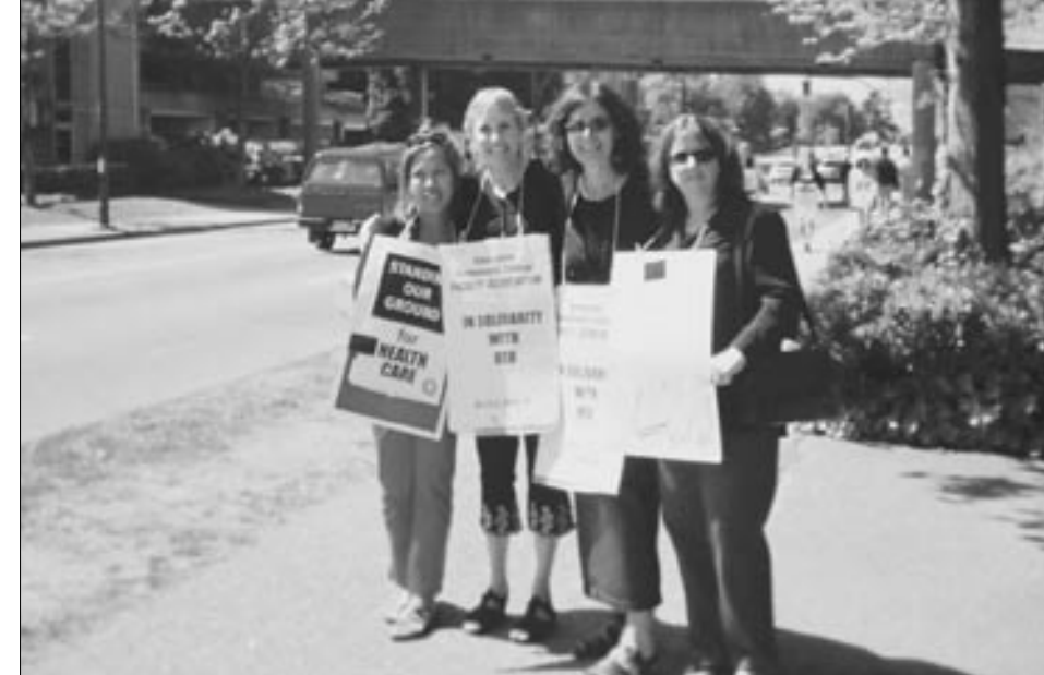
HEU workers and their supporters picketing at Vancouver General Hospital, April 29th 2004.

The contracting out and the privatization just scares me, it scares the hell out of me.