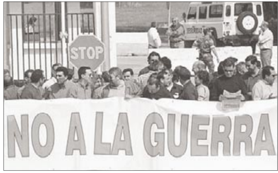
Workers in Spain demonstrate against the proposed US-led War on Iraq, March 14th