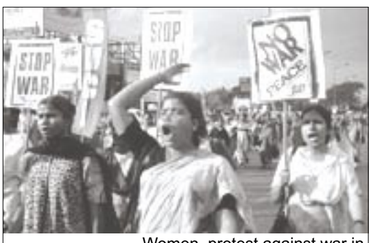
Women protest against war in Calcutta, India, October 8th 2002

On Saturday, March 8, millions of women throughout the world marched, rallied, and celebrated International Women's Day (IWD). What made this year's IWD different from previous