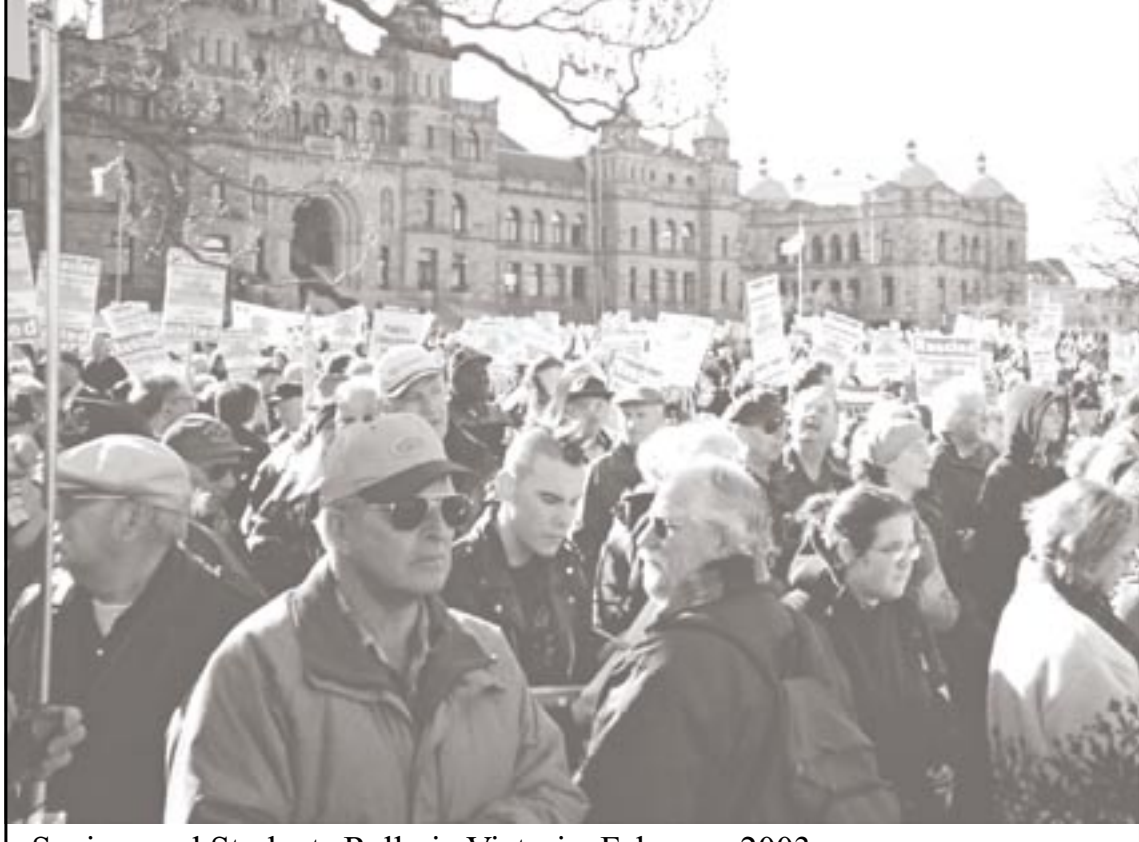
Seniors and Students Rally in Victoria, February 2003