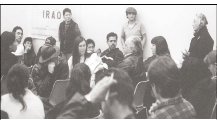
Discussion period at Fire This Time's 'War on Iraq' Forum, February 17th 2003.

According to the proposed Bill C-18, Federal court would be able to revoke citizenship without disclosure of evidence if the presence of the citizen is found to be "injurious to national security or the safety of any person". The secret evidence would not even have to be admissible in court of law and the decision would not be open to appeal. The Immigration minister would personally be able to annul the citizenship of a refugee if the minister considered their status to have been acquired