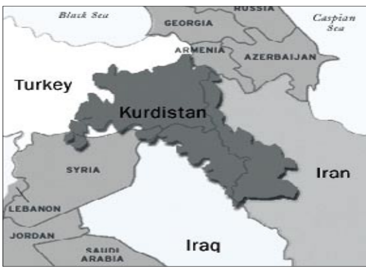
Map showing where the Kurds live.

Ever since the establishment of Turkey in 1923, the Turkish Kurds have had to struggle just to be recognized as a people; they've been faced with active assimilation programs and, in some cases, total eradication. The Turkish state has denied the existence of Kurds, referring to them as "mountain Turks" and banning all reference to a separate culture, language, flag, etc. Law 2510, passed in June 1934, divided Turkey into three areas: "(1) localities to be reserved for the habitation of persons possessing Turkish culture; (2) regions to which persons of non-Turkish culture could be moved for assimilation into Turkish culture; (3) regions for complete evacuation." The harsh incredibly measures taken by Turkey resulted in the establishment of a strong Kurdish movement in Turkey, which still exists today. The Turkish and