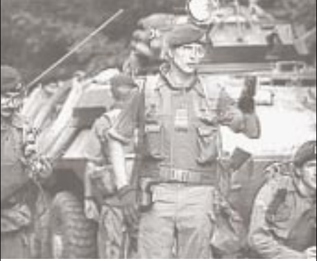
Canadian troops on patrol during the 1990 Oka standoff. Over 4000 Canadian troops were deployed to 'settle' the dispute with the Mohawk people of Kanesatake.

The effects of imperialism on Indigenous lives are not limited to the effects you hear about. For one thing, it's known historically that when American soldiers are in town during war or occupation, the