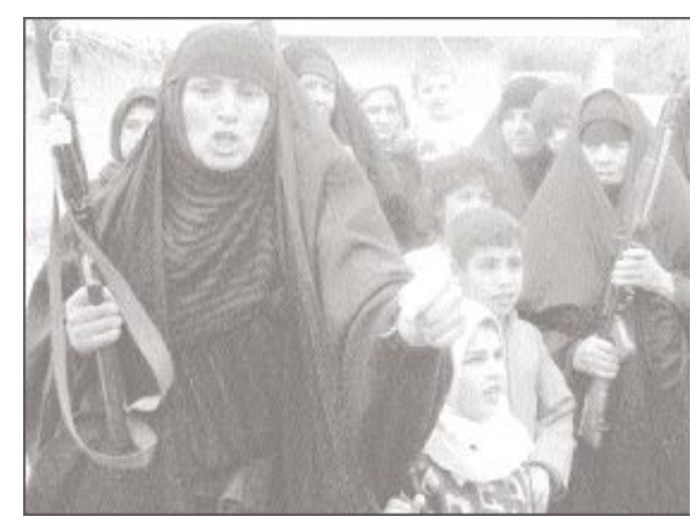
Iraqi women with children brandish their guns as they shout anti-American slogans near Yousifiya, 30km south of Baghdad, March 25th 2003

The continued armed Iraqi resistance, the demonstrations against both the military occupation and the US-sponsored plans for post-war Iraq, the Iraqi people's repeated denunciation of both Saddam and the Western occupiers: all of these show that the US and UK governments are clearly not simply waging a battle against isolated Ba'ath Party loyalists and for the 'liberation' of Iraq. They show that the Iraqi people do not welcome the invasion and occupation of their country, and that they will continue to resist until the US and UK military are out of their country for good.