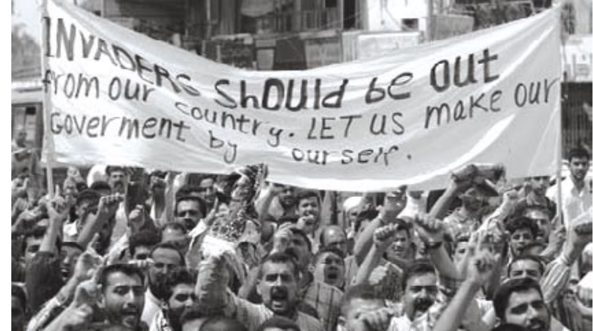
Iraqis protest the US-UK military occupation of their country, April 18th 2003

This quote exposes what the US government really had in mind before the war, as well as their strategy for today and for tomorrow. All that has been said about finding Weapons of Mass Destruction, stopping terrorist activity, regime change, and liberating Iraq, were nothing but lies and war propaganda. The US government has had only one aim: occupation of Iraq until they have planned, prepared, and are ready for the next war and occupation. "As long it takes" means further suppression, further tyranny, and the further killing and terrorizing of Iraqi people.