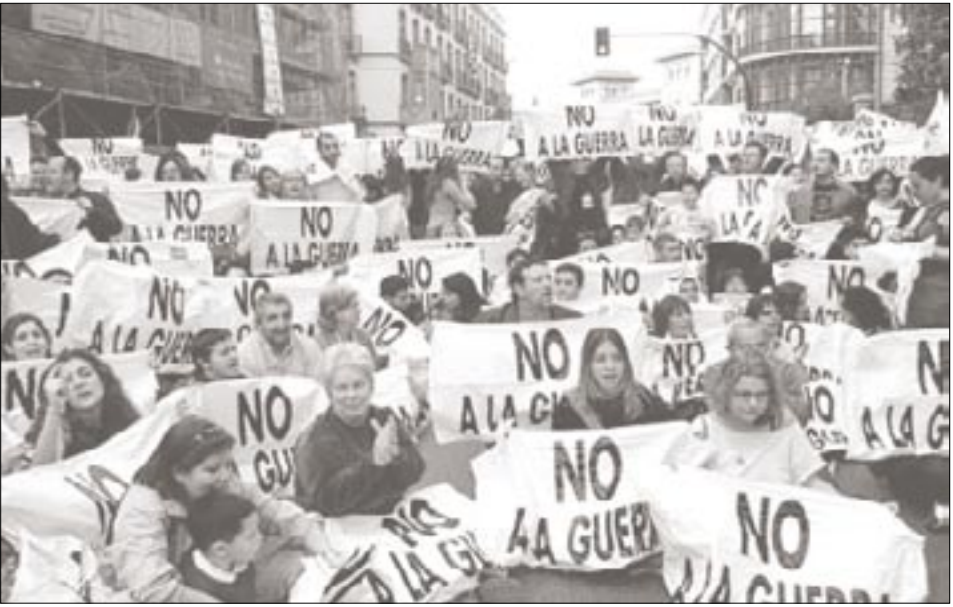
Anti-war demonstration in Granada, Spain, March 15th 2003

To do this movement justice, and to strongly, effectively respond to the imperialist assaults, we must build and fight to end to all wars and military assaults against people. The level of consciousness that exists when a movement is truly popular and mass-based allows for