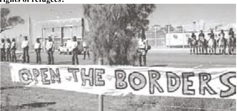
Banner hung during protest at Baxter Refugee Camp in Australia, April 18th 2003.

What is your background with refugee issues? How do you relate to the struggle for the rights of refugees?