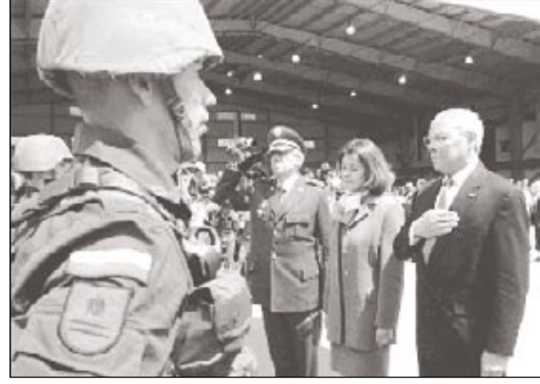
Secretary of State Colin Powell on a trip to Colombia, December 2002

with extensive oil reserves, amongst the largest in the world. Like its neighbour Venezuela, the principal export product of Colombia is oil. Six hundred thousand barrels of crude oil are exported daily, mainly to the United States. Even so, the vast majority of Colombia's 40 million people live under the poverty line. Government after government has been unable to secure and provide minimum [decent] living standard for workers and peasants in the country. Civil war and corrupt governments have created deep miserable social and economic conditions for the Colombian people. It is no wonder that this absolute desperation and poverty gives many peasants no choice but to plant coca in order to survive. With the accumulation of decades of negligence and lack of planning by government institutions and rich land-owners, coca remains the only means