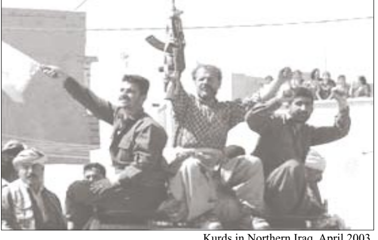
Kurds in Northern Iraq, April 2003

Kurdish people all around the Middle East have demonstrated that they are determined to gain their rights by any means necessary. The history of the Kurdish people is a good witness of that. The Kurdish struggle, based on their demand for national rights, is just, humane and legal. The Kurdish struggle must therefore be supported by all working, poor, and oppressed people around the world.