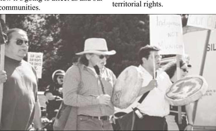
March and Rally against the First Nations Governance Act in Vancouver, June 4th 2003

I think it's important for us to oppose the FNGA because our leadership has failed to back us up on this one. They've dropped the ball, so to speak. They're too busy having their big bureaucratic lunches, saying 'no FNGA,' but they've failed to let the people know, first of all, what the FNGA is about, and second, how it's going to affect us and our communities.