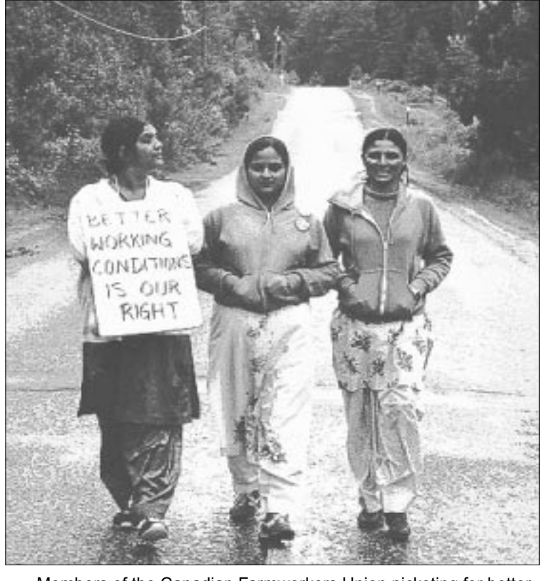
Members of the Canadian Farmworkers Union picketing for better working conditions, 1984

One reason for this lack of information lies in the legislation itself. Under the old Act, employers were required to display a poster supplied by the Employment Standards Branch which provided information about the various rights of