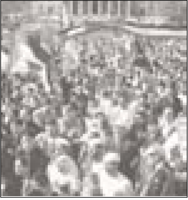
Rally in Solidarity with Palestine in London, May 2002

On Dec 8 1970 the UN General Assembly adopted resolution 2767 which "recognises that the people of Palestine are entitled to equal rights and self-determination in accordance with the Charter of the UN." This was reaffirmed more strongly in UNGA 2787 of 6 December