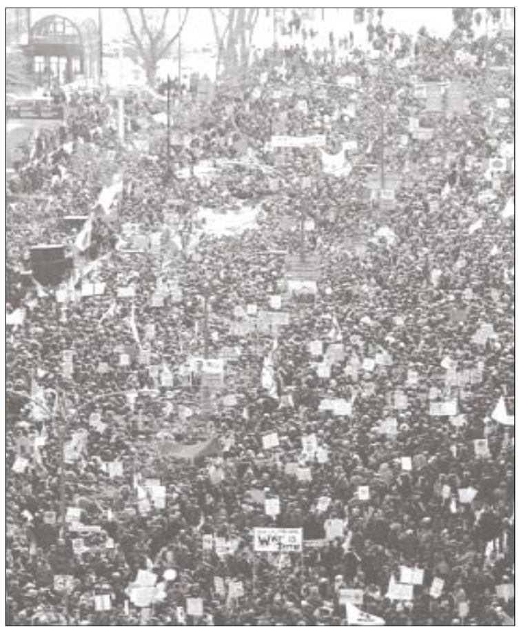
Antiwar Rally in Montreal, March 15th 2003

In order to improve the conditions of working people as a whole, we must start by defending at least a minimum set of standards for the most exploited workers by establishing full unionization of every workplace. We must also demand that the amendments to the Employment Standards Act be revoked. All the basic employment standards that the provincial government is taking away were fought for in the past, and if we hope to win decent wages and dignified working conditions for everyone, we must fight for them again.