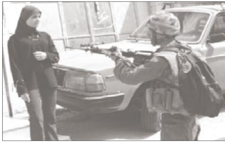
Israeli Soldier pointing gun at Palestinian civilian in Hebron, October 2002