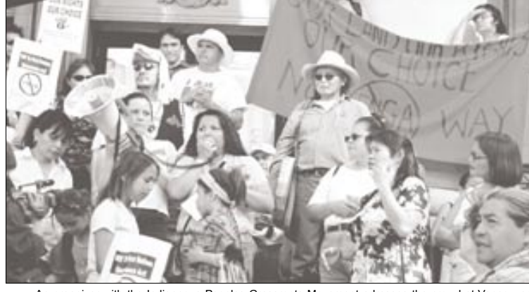
An organizer with the Indigenous Peoples Grassroots Movement adresses the crowd at Vancouv

They're shifting the legal definitions of Indians and Indian