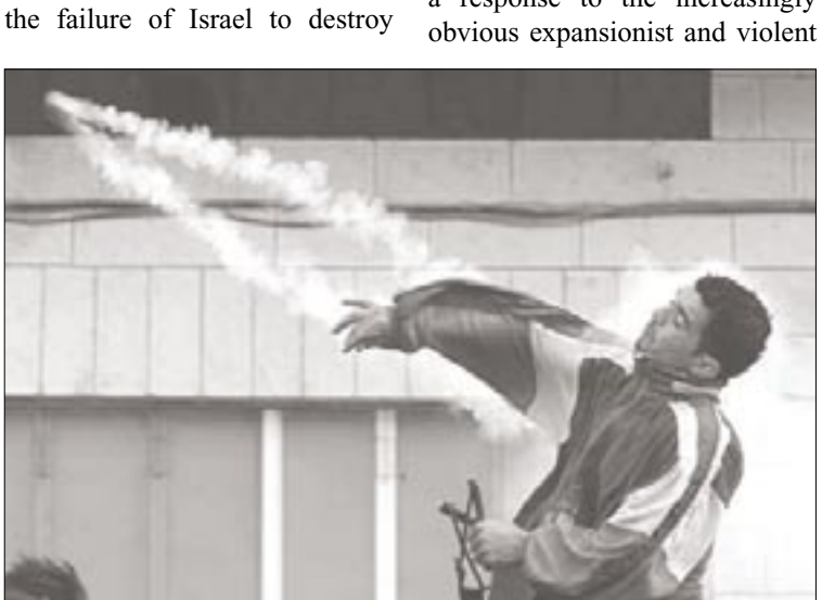
A Palestinian throws a teargas cannister back at Israeli Military forces.

One of the most significant aspects of the Palestinian and Lebanese resistance was their success in holding Israeli troops at bay for two months. As well as forcing negotiations for the evacuation of PLO fighters from Lebanon which symbolized the failure of Israel to destroy